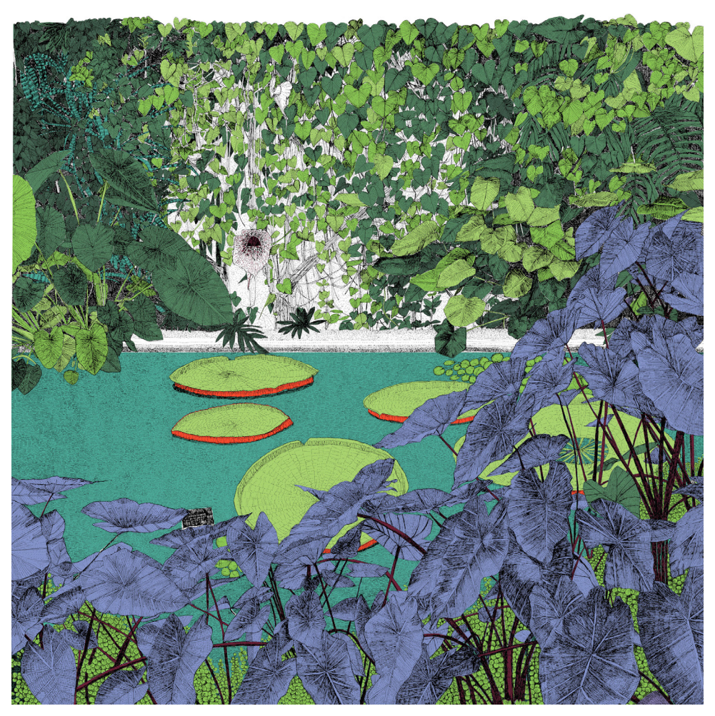
'A Wonder of Waterlilies' Clare Halifax 9 Colour Screenprint 60 x 60 cms £695