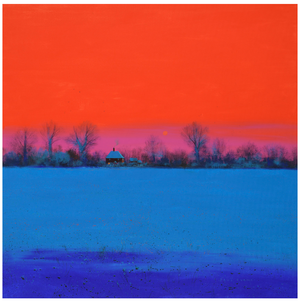
'Incredible Winter Evening' Paul Evans Acrylic on Canvas 120 x 120 cms £5500

Back Cover 'A Blow Along the Line' Janet Nelson Acrylic on Canvas 100 x 100 cms £2395