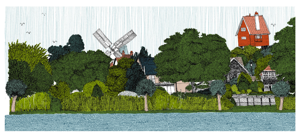
'Thorpeness Highlights' Clare Halifax 10 Colour Screenprint 15 x 35 cms £275