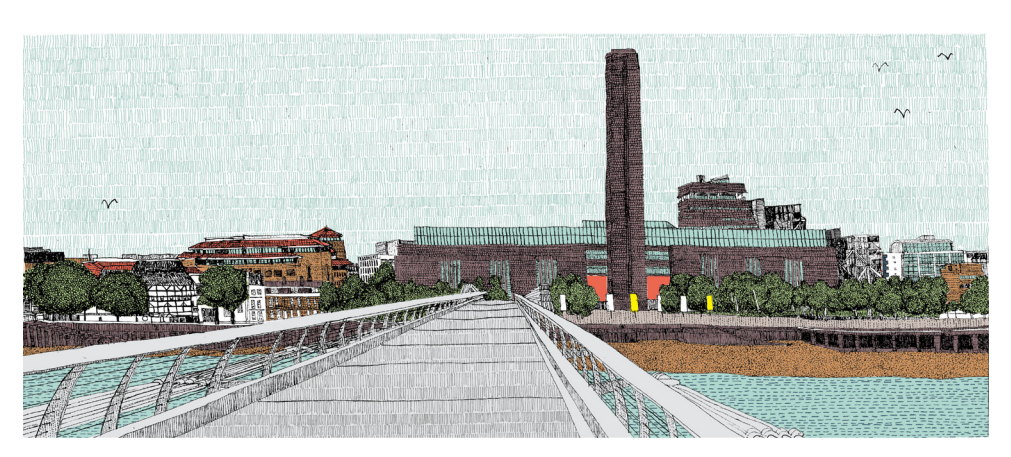
'Millennium to Tate Modern' Clare Halifax 11 Colour Screenprint 15 x 35 cms £275