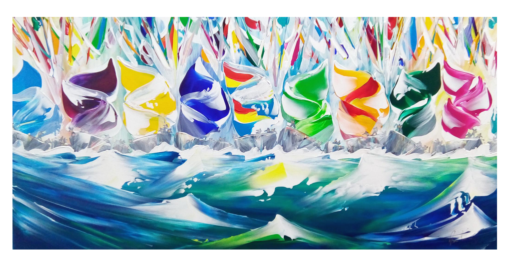
'Holding the Spinny' Janet Nelson Acrylic on Canvas 40 x 80 cms £1495