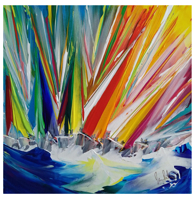
'A Close Battle' Janet Nelson Acrylic on Canvas 30 x 30 cms £695