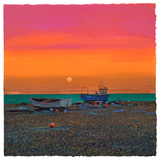
'Aldeburgh Sunrise' Paul Evans Ink & Acrylic 38 x 38 cms £1275