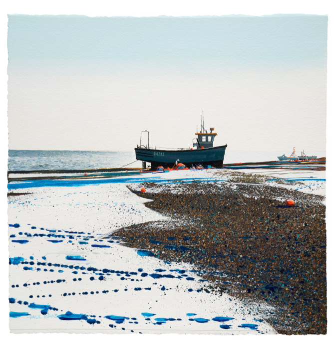
'Winter Light' Paul Evans Ink & Acrylic 38 x 38 cms £1275