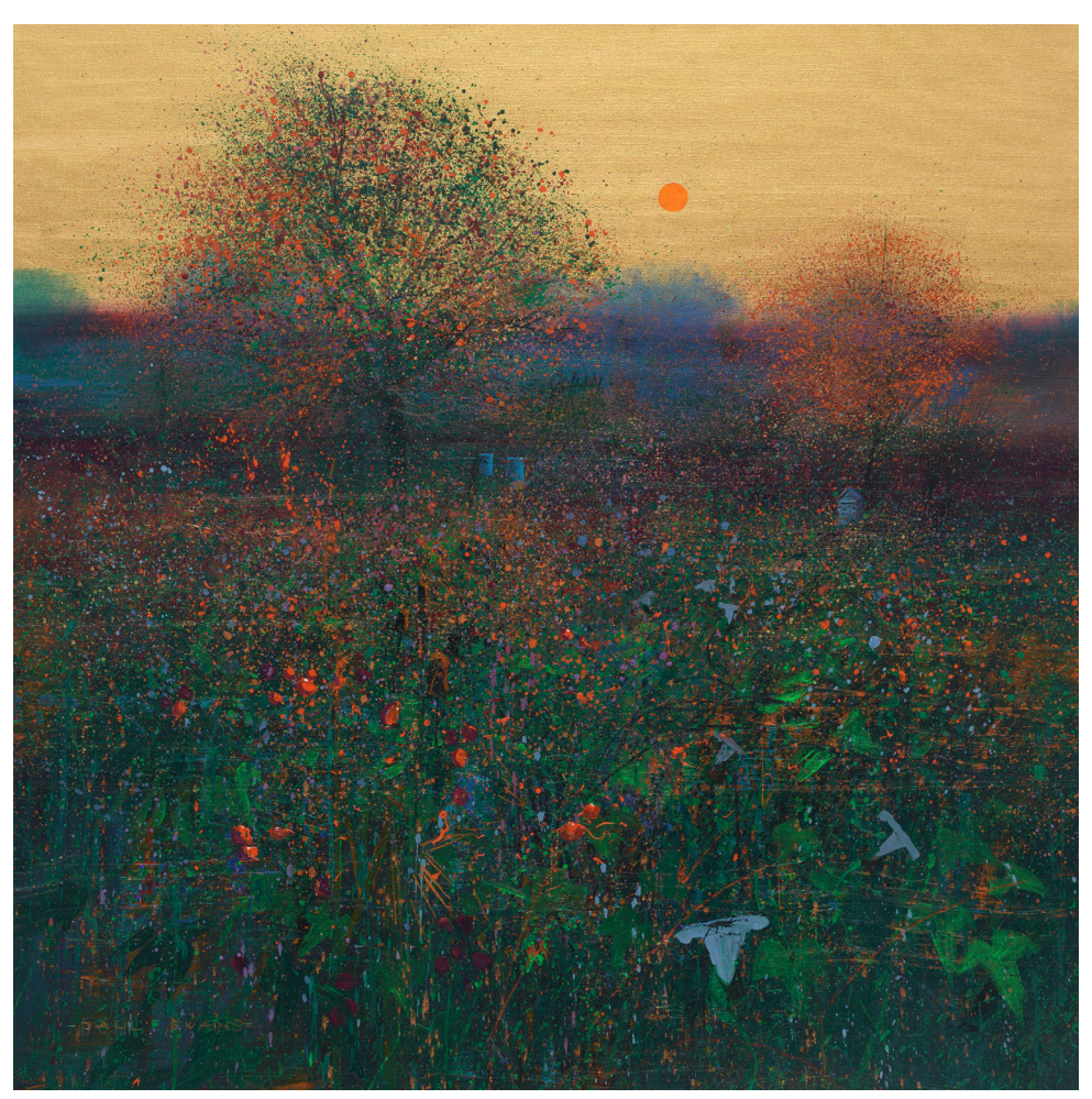
'In the Artist's Orchard' Paul Evans Acrylic on Canvas 90 x 90 cms £4500