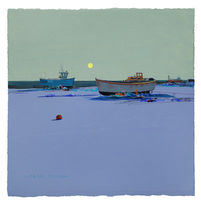
'Winter Beach' Paul Evans Ink & Acrylic 38 x 38 cms £1275