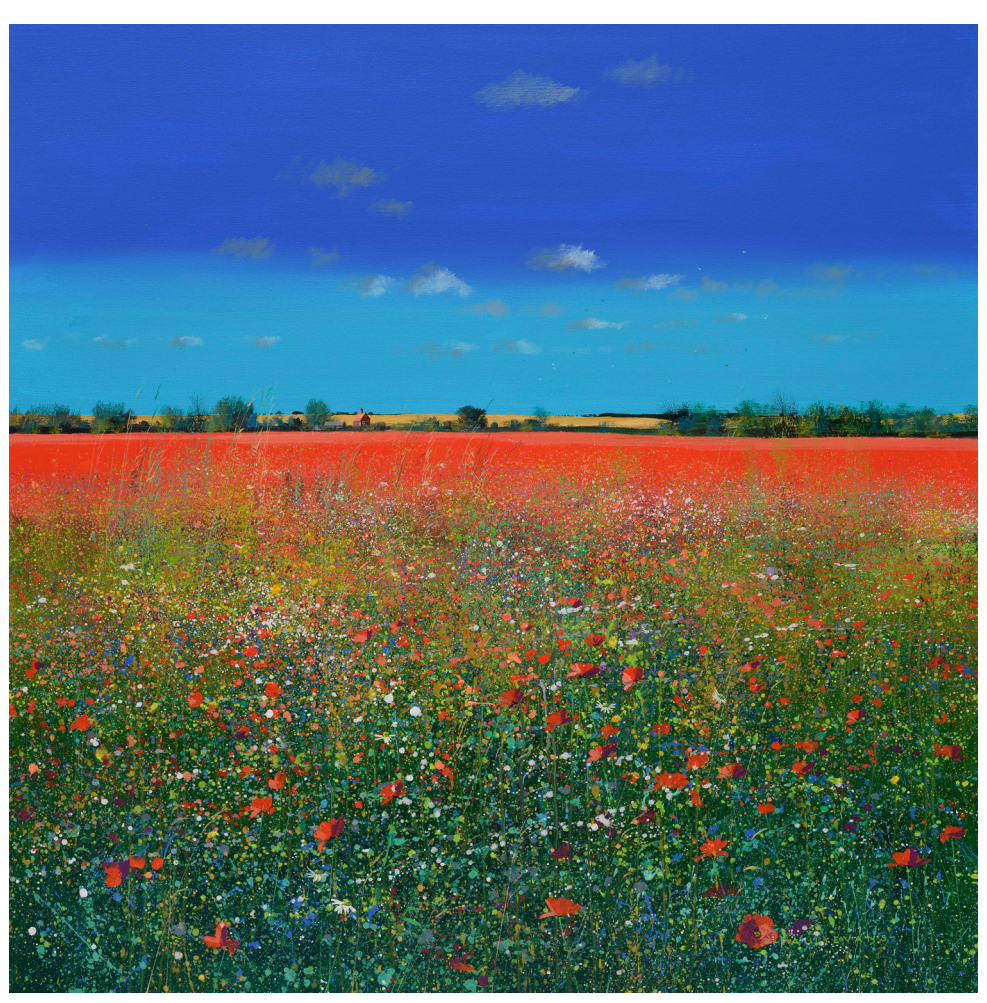
'The Red Field' Paul Evans Acrylic on Canvas 92 x 92 cms £4500