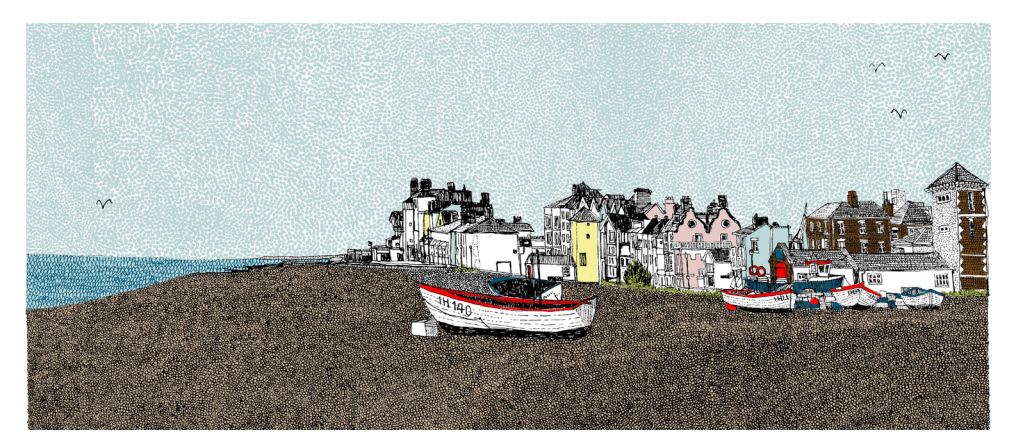
'Aldeburgh Boats at Old Lifeboat House' Clare Halifax 10 Colour Screenprint 15 x 35 cms £275