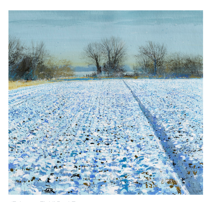
'February Field' Paul Evans Ink & Acrylic 28 x 28 cms £875