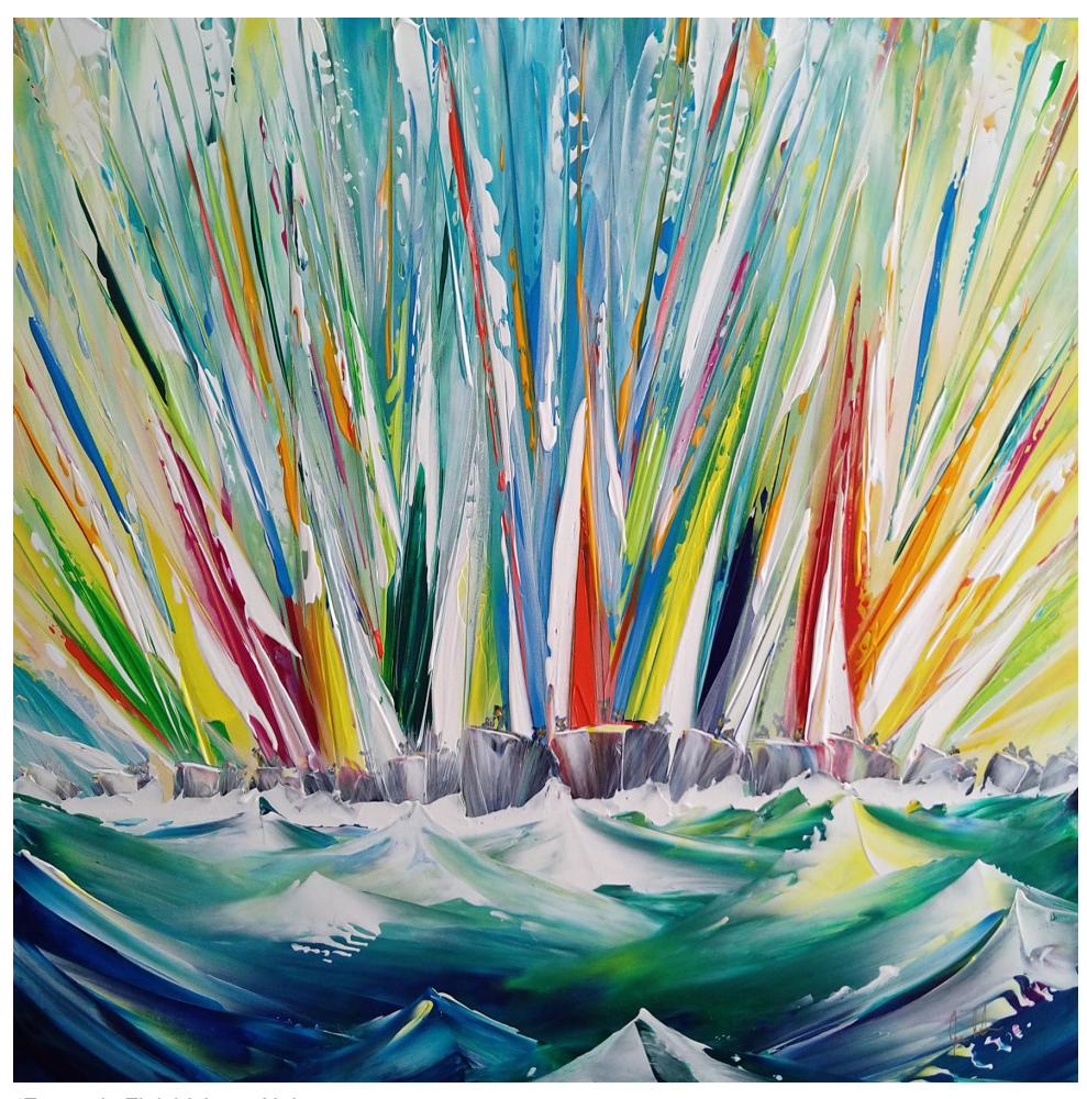
'Fantastic Finish' Janet Nelson Acrylic on Canvas 60 x 60 cms £1595