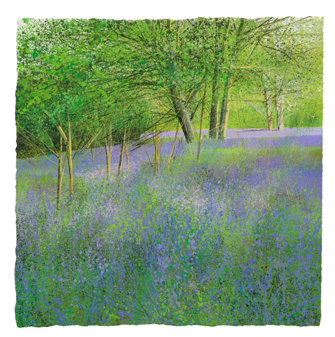
'On the Edge of Dollops Wood' Paul Evans Ink & Acrylic 38 x 38 cms £1275