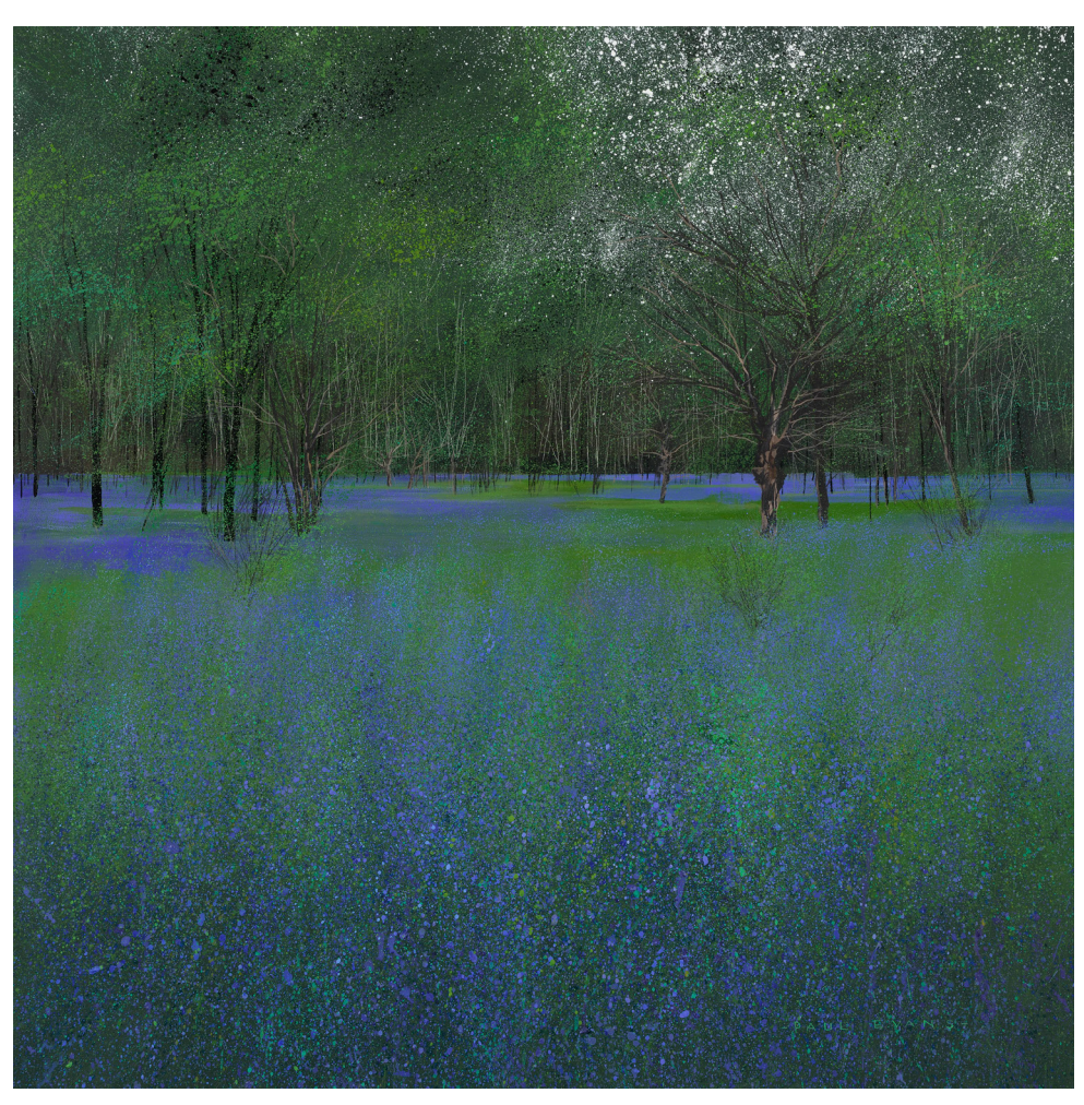
'Dollops Wood' Paul Evans Acrylic on Canvas 120 x 120 cms £5500