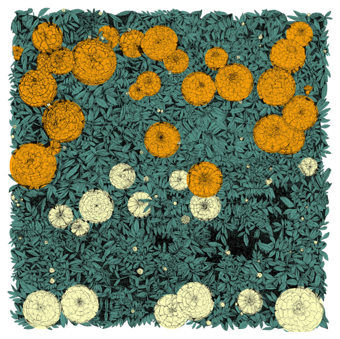
'French Marigold' Clare Halifax 4 Colour Screenprint 35 x 35 cms £295