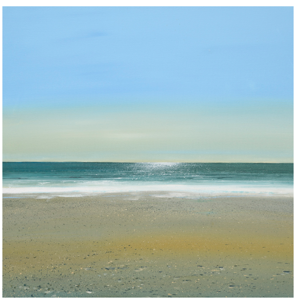
'Southwold Sea Sparkle' Paul Evans Acrylic on Canvas 61 x 61 cms £2250