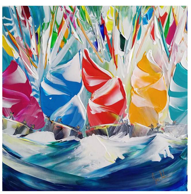
'A Perfect Breeze' Janet Nelson Acrylic on Canvas 30 x 30 cms £695