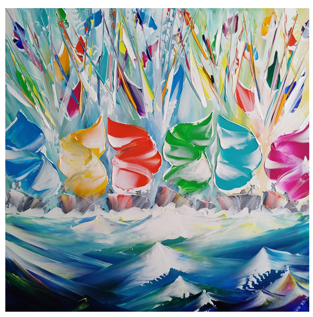
'End of the Race' Janet Nelson Acrylic on Canvas 60 x 60 cms £1595