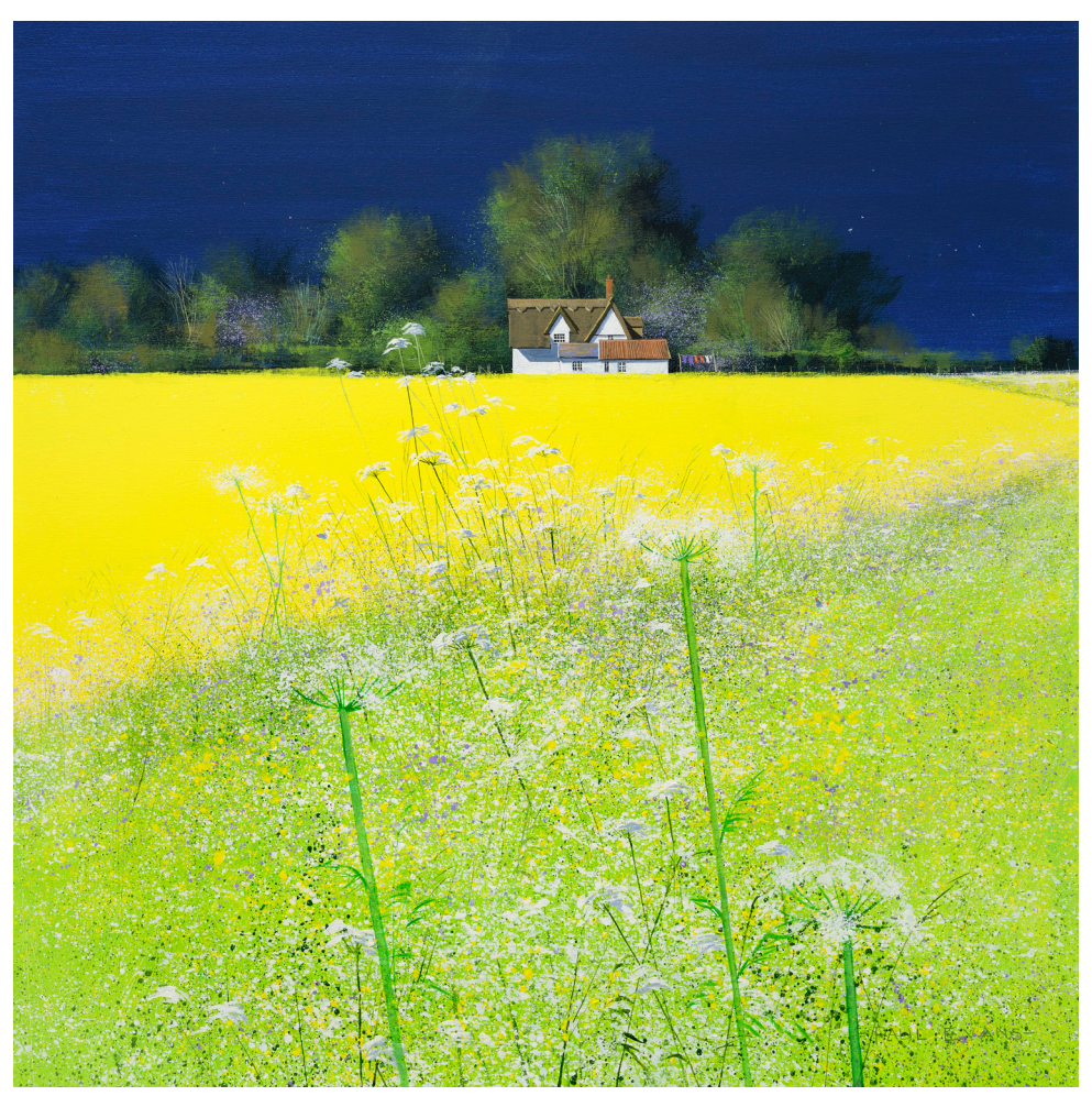
'Spring Colours' Paul Evans Acrylic on Canvas 92 x 92 cms £4500