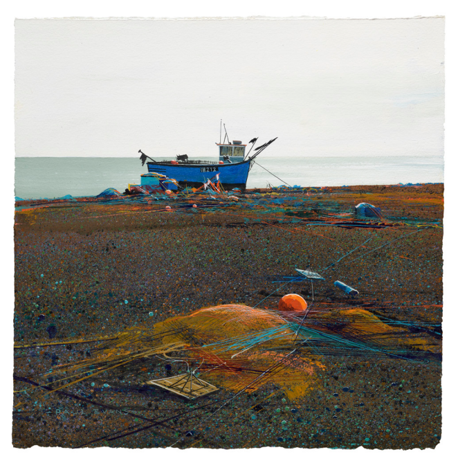
'Aldeburgh Boat' Paul Evans Ink & Acrylic 38 x 38 cms £1275